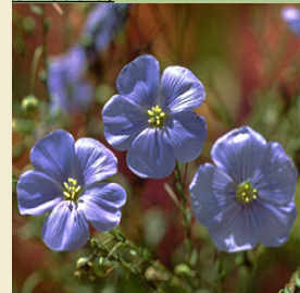
Blue Flax - (Linum lewisii)